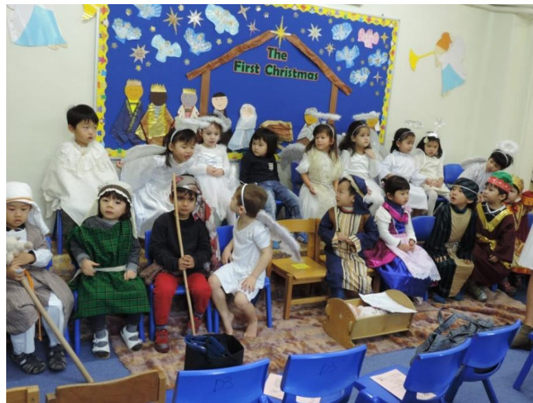
"The First Christmas"